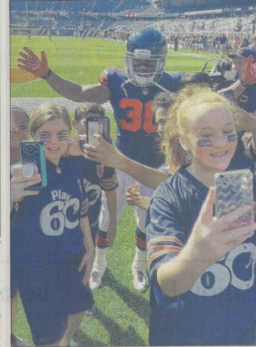
District 59 students from Grove and Holmes junior high schools smile for selfies with Chicago Bears running back Benny Cunningham. The students played flag football on the field at halftime Sept. 24 as part of their participation in the "Fuel Up to Play 60" program.

Hogan was proud of all the students who attended, and the determination and perseverance they continuously