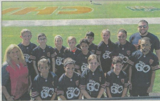
District 59 students and staff members from Grove and Holmes junior high schools take advantage of a photo op in the end zone at Soldier Field. The students played flag football on the field at halftime on Sept. 24 as part of their participation in the "Fuel Up to Play 60" program.

As the FUTP60 excitement and self-awareness on the importance of healthy habits have grown, additional