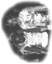
The Madison Area Anokijig