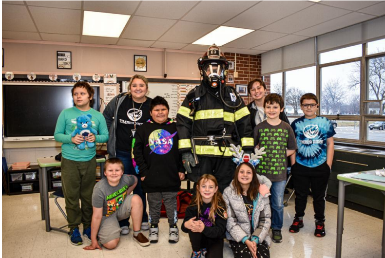
Fire Department Visit at Timber Ridge School