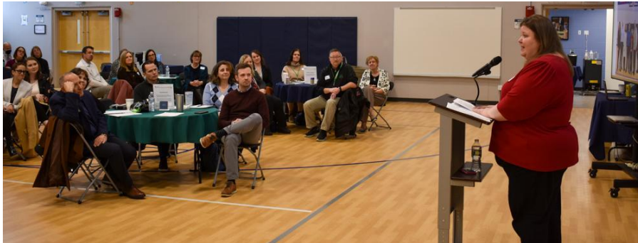
NSSEO 4th Annual Legislative Roundtable